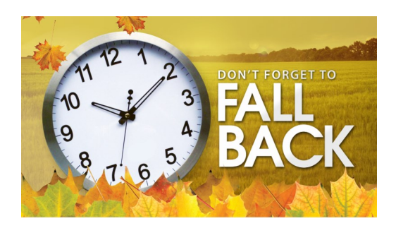
November 4 before you go to bed!!