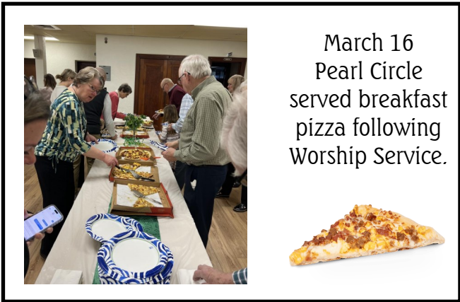
March 16 Pearl Circle served breakfast pizza following Worship Service.

Food, fellowship & some toe tappin' music were enjoyed by 80 men!